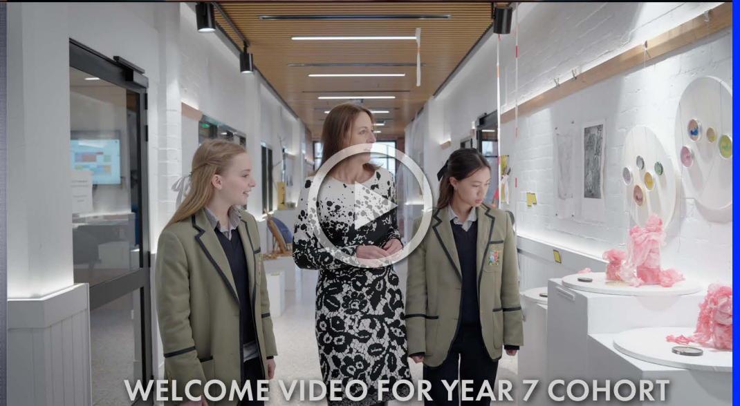
WELCOME VIDEO FOR YEAR 7 COHORT