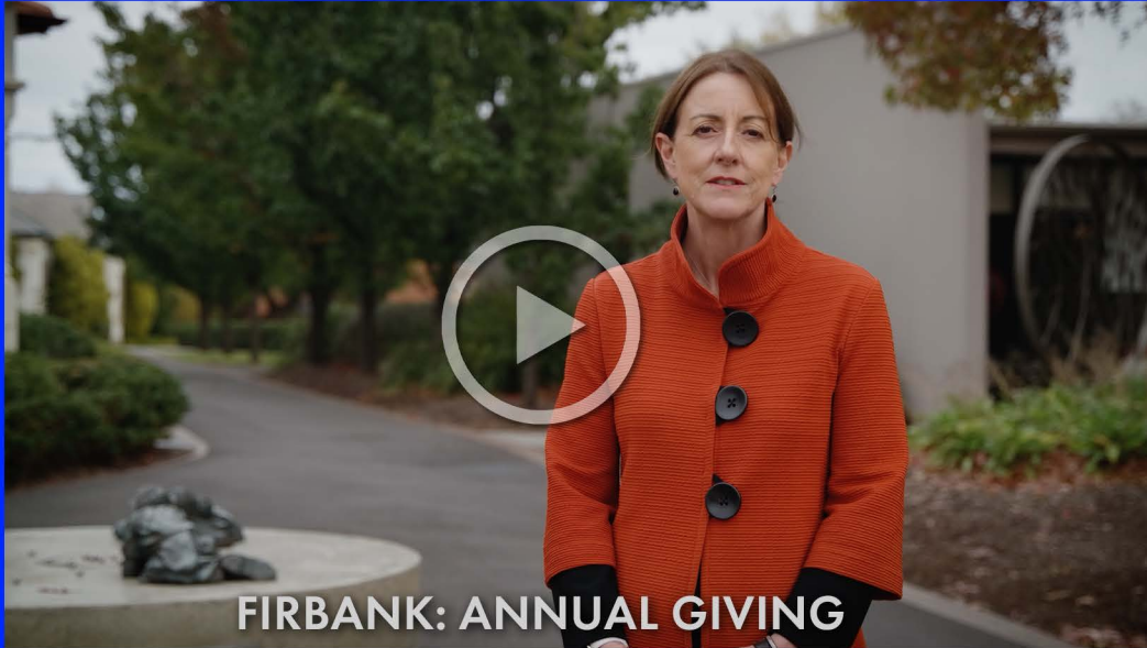
FIRBANK: ANNUAL GIVING

A SMALL COLLECTION OF VIDEOS WE HAVE CREATED FOR OUR CLIENTS