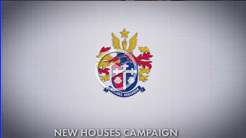
NEW HOUSES CAMPAIGN