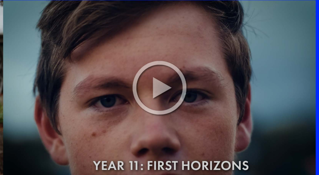
YEAR 11: FIRST HORIZONS